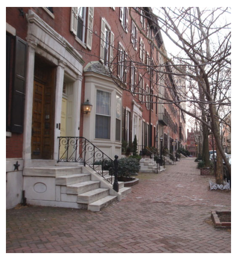
The fact remains: The great majority of new single-family detached houses and town houses still have steps at all entrances and narrow bathroom doors.